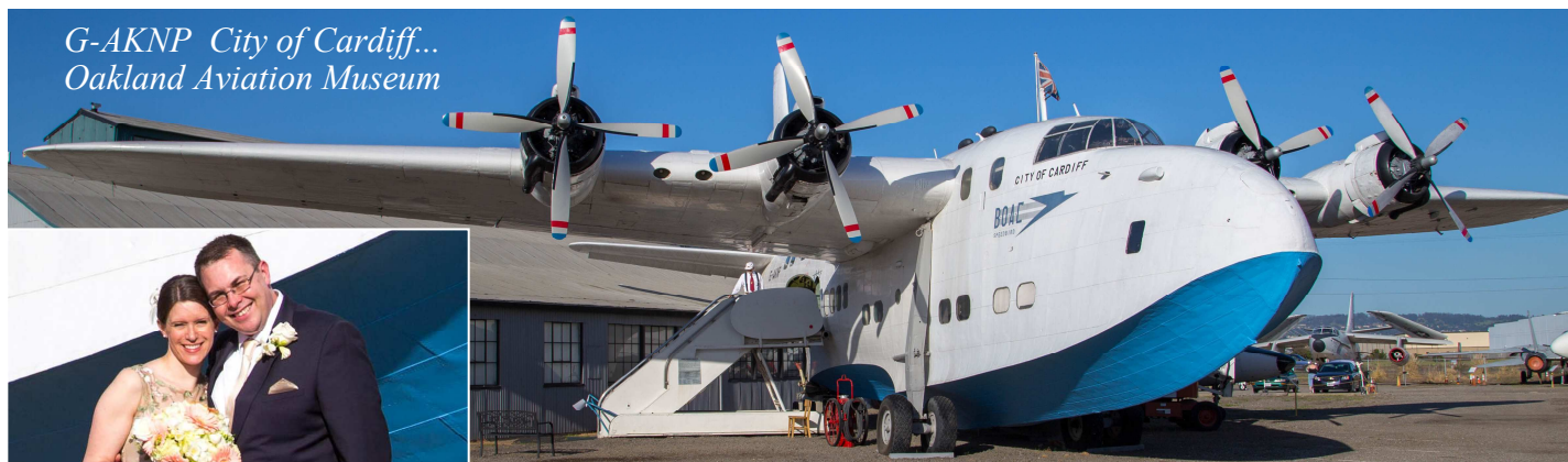
G-AKNP City of Cardiff... Oakland Aviation Museum

[ *For this marvellous uplifting story please see Col. 5 ]