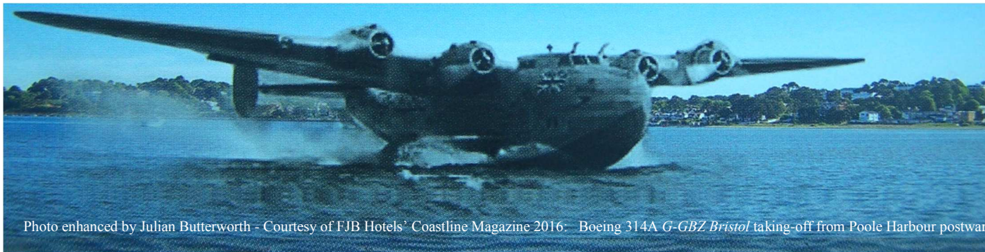
Boeing 314A G-GBZ Bristol taking-off from Poole Harbour postwar

In May 1945 my father (still serving in the RAF), landed in Poole Harbour on an RAF Flying boat, having come in from Singapore. He'd been ordered next to attend the Air Ministry in London, and stayed overnight at Harbour Heights, which was at that time an RAF Transit Mess ... So he departed for London shortly after arriving back. He told me that the weather was unusually cold, indeed it was snowing and they all were walking around in the 'Biggles type' flying jackets to keep warm; it must have been quite a shock after the hot and humid Singapore!