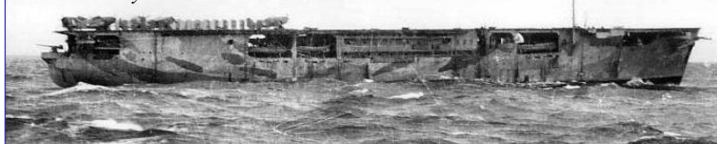
HMS Audacity lost 21st. Dec. 1941

Desert Island Discs... http://www.bbc.co.uk/programmes/b04nvgq1#play