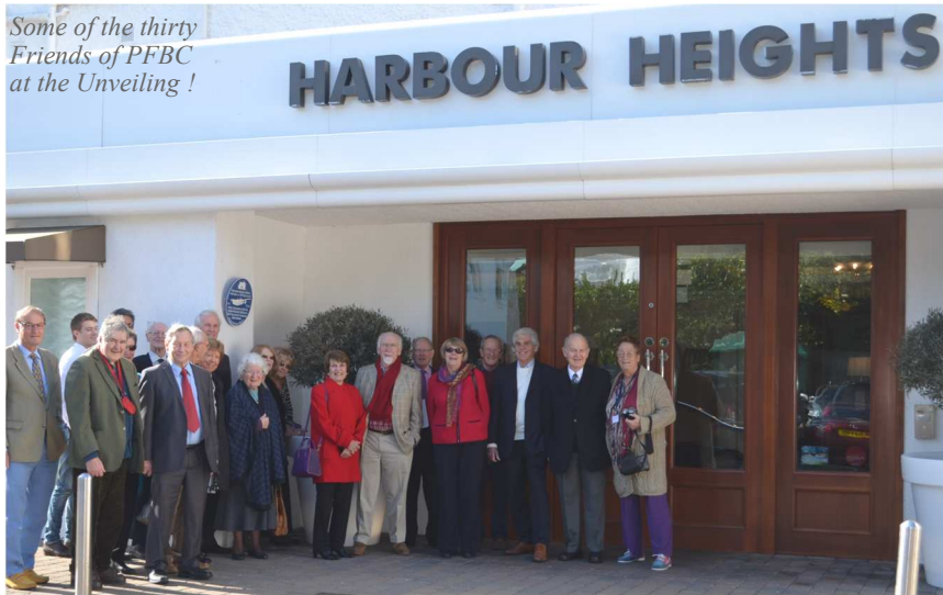
Some of the thirty Friends of PFBC at the Unveiling!