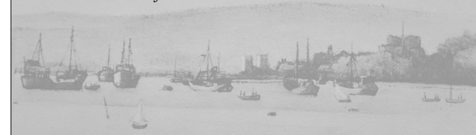
Huddled in the lee of Brownsea Is

By July 1940, a total of 18,000 Belgian + 1,000 Dutch & others, had refuge provided; some went on by sea or air; many did not enter employment without the consent of the Min. of Labour, in support the war effort until war ended, and then go home. So initially everyone had to be processed, and be in a camp... such as the one built on Brownsea with canvas & local timber. [That is why WW2 photos of Brownsea appear denuded of trees.] The local Health Authorities, support services & Immigration were involved until the temp. accommodation was emptied, and a few enemy infiltrators were weeded out + dealt with !