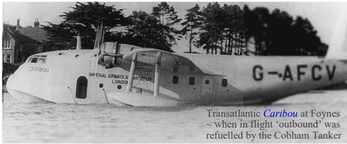
Transatlantic Caribou at Foynes ~ when in flight 'outbound' was refuelled by the Cobham Tanker