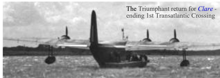
The Triumphant return for Clare - ending 1st Transatlantic Crossing

Besides an intervention of the 1939 Autumn Series with a switch to Poole there would be a further series the following year using Clare and Clyde , which had such profound impact upon national morale via media interest during the height of the Battle of Britain , that now cannot be overstated.