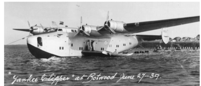
"Yankee Clipper" at Botwood June 27-39.

At the same time Clipper III was crossing the Atlantic, IAL's Caledonia was travelling in opposite direction via Foynes & Botwood etc. to NY. These proving flights were underscored by an arrangement between the US + UK to share this route in mutual benefit of each operator ! However on the 24th. June 1939, the inaugural Transatlantic Flight by PanAm's Boeing 314 Yankee Clipper brought 'a new dimension' to the immense capabilities of a greatly improved Flying Boat type.