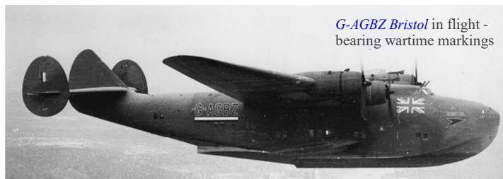
G-AGBZ Bristol in flight - bearing wartime markings

This paved the way for the purchase of the trio of Boeing 314As Bristol , Berwick + Bangor in 1941, ordered for PanAm, but which were acquired by the British Govt. with permission from the US President - Roosevelt... Specifically introduced on the Poole to W. Africa route, although it was stipulated that their essential maintenance be conducted at Baltimore - that opened up a northerly Transatlantic route via Foynes and Botwood , as well as southerly Transatlantic routes initiated via Gambia and Brazil. *These operated until 1946, when switched to the Bermuda - US Shuttles .