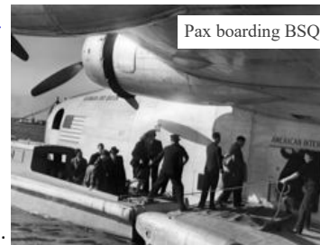
Pax boarding BSQ

So on the 12th. Oct. 1947 the BSQ was at Poole boarding 62 pax for Foynes & Newfoundland but was ditched close to the USCG vessel Bibb , when it was running out of fuel due to 'strong head winds' ! With 7 crew, all 69 were rescued but BSQ had to be sunk by gunfire.