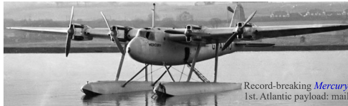
Record-breaking Mercury 1st. Atlantic payload: mail

With the total of 7 Poole Flying Boats of IAL/BOAC 'transitting' through Foynes and Botwood en route to Montreal before proceeding to the US, there was also the link that within the fleet moved to Poole, there was the 'Composite' pair of Maia and Mercury - which operated separately from here: Mercury secretly used upon 'intelligence-gathering missions' + Maia converted to C-Class standard for Poole-Foynes Shuttle Services . Whereas previously Mercury , assisted in take-off for Transatlantic flight by Maia . had made a significantly successful crossing from The Solent - then returning by her own power borne eastwards by prevailing winds !