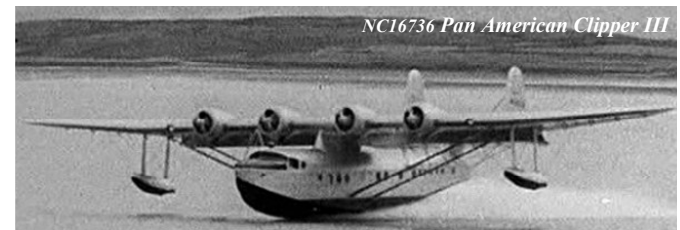
NC16736 Pan American Clipper III

In 1937, the US Travelogues proclaimed the success of PanAm's Sikorksy S-42 ( Boeing 307 ) Clipper III in following Lindbergh's Trail.