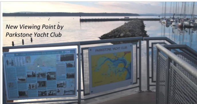
The PFBC Aye Ma'am Storyboard installed at Parkstone Yacht Club

The Trustees of PFBC are delighted that we have a new Storyboard site