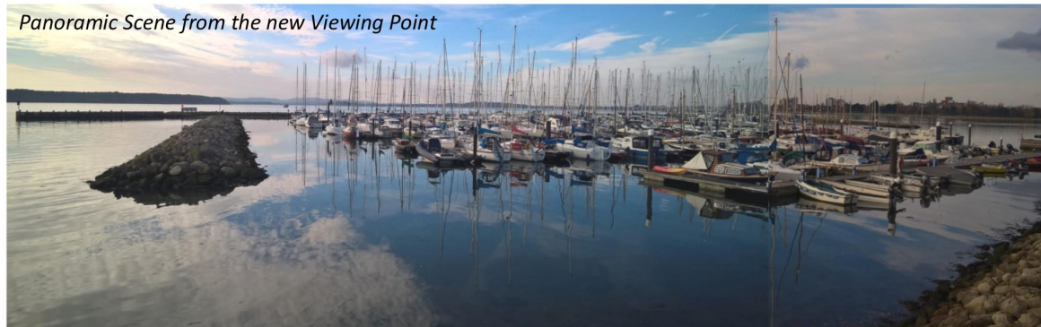
Panoramic Scene from the new Viewing Point