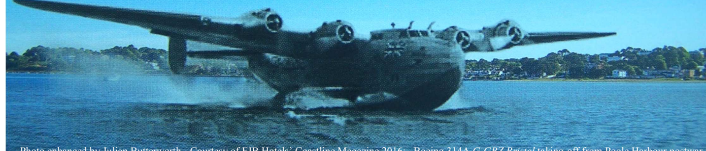
Boeing 314A G-GBZ Bristol taking-off from Poole Harbour postwar

More than 100 Flying Boats, both military and civil air were involved over the years with Poole Harbour... but a trio were especially synonymous with Harbour Heights - these were the giant US-built Boeings - Bristol, Bangor, and the favourite of Winston Churchill - Berwick! [He flew on Berwick and Bristol.] These were a vital Transatlantic link with Canada and the US... also connecting Africa, S.America, the Windies and Bermuda... Each clocking-up more than a million Transatlantic miles, until the final crossing from Poole to Baltimore on the US east coast. exactly 70 years ago on the 10th. March with the Unveiling by Poole Cllr. Mohan Iyengar (most fittingly previously with BA) !